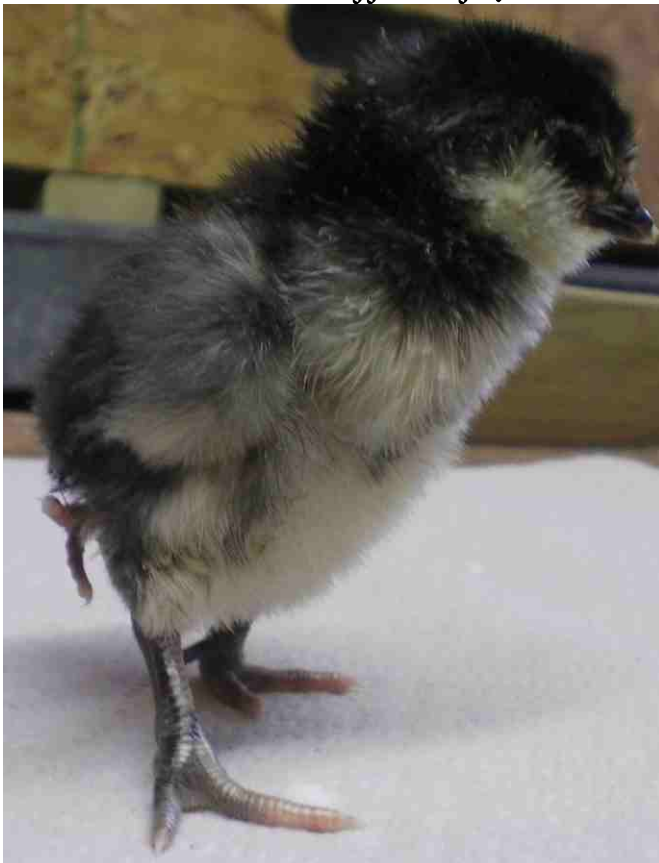
A 4 legged large fowl black Ameraucana - John W Blehm 2012